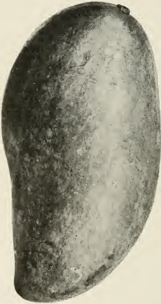
TYPICAL FRUIT OF THE FILIPINO RACE. JOVELLANOS MATANZAS PROVINCE.